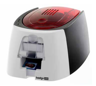
Badgy200 card printer