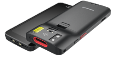
The CT37: 5G mobile computer on the Mobility Edge™ platform, elegant, slim, powerful, durable, and easy to use.

The CT37 also comes with the latest 5G and Wi-Fi 6E technology to stay connected in both indoor and outdoor environments. 5G offers the highest bandwidth and lowest latency available for frontline workers. Whether you are on a private 5G or CBRS network, or a Wi-Fi 6E environment, your networks can continue their workflows with reliable uptime.