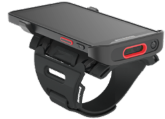
The CT37 Wearable solution for a hand-free

The CT37 is armed with the latest FlexRange FR bright green dot laser, which is more visible at long distance and under strong sunlight than devices configured with red dot laser. It brings long range scanning performance found in industrial devices to lightweight, pocketable devices like the CT37. The ultimate in flexibility, FlexRange enables virtually every scanning use case in a single, compact device without compromising range or speed, enabling businesses to focus on fewer device types to manage.